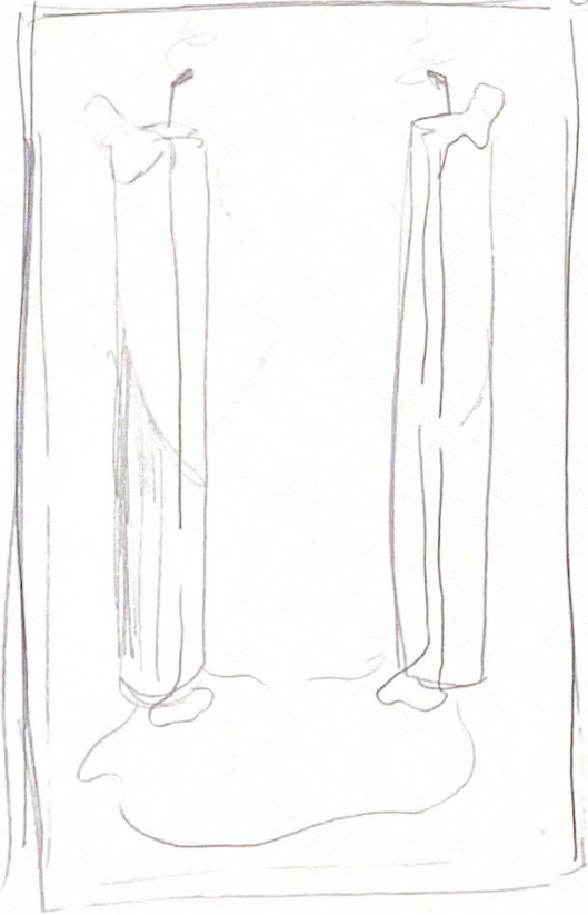
→ water horizon